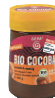
Gepa's Bio Cocoba Chocolate Spread Very Good, ÖKOTEST Origin: Latin America