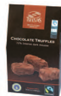
Belvas's Chocolate Truffles Palm, Quality Food Awards Origin: Dominican Republic, Paraguay