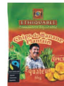
Ethiquable's Spicy Banana Plantain Chips Golden Archer Best Ethical Product, Belgian Committee of Distribution Origin: Ecuador

Fairtrade products are gaining recognition not only for ethical leadership but for excellence in taste and quality – thanks to producers' superior Fairtrade ingredients carefully crafted by partner businesses into award-winning products.