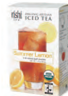
Rishi Tea 28 awards including 11 First Place, World Tea Championship Origin: China, India, Egypt