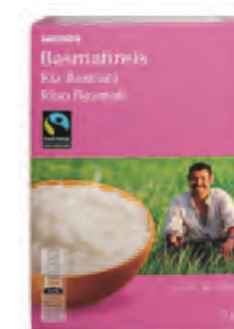
Migros' Basmati Rice Top rated, TESTBESTE Origin: India