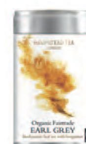
Hampstead Tea's Earl Grey Leaf Tea Non Alcoholic Beverages Award, Soil Associations Food Awards Origin: India