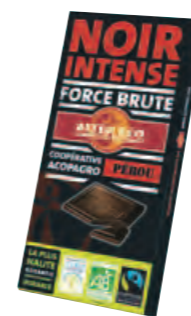
Alter Eco's Noir Intense Force Brute Pérou Top place, Que Choisir Origin: Peru